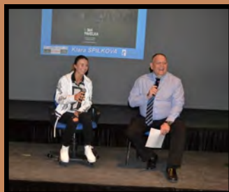
The Golf Player Klara Spikova