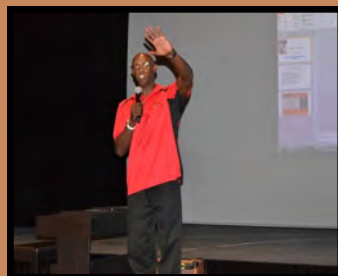
The Olympic Gold Medalist Butch Reynolds